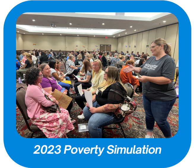
2023 Poverty Simulation

Poverty is often portrayed as a stand-alone issue, but this simulation allows individuals to walk a month in the shoes of someone who is facing poverty and to realize how complex and interconnected issues of poverty really are.